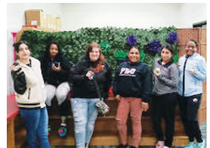
The BOOST Grant funded Girls' Wellness Day