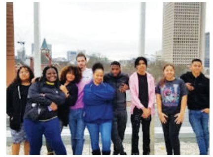
Performance Learning Center students visit Georgia Tech.

Advantage Academy is an alternative program serving middle and high school students who have been removed from the traditional school setting due to disciplinary infractions. The instructional program is a blended model of online and traditional learning scheduled in two half-day sessions (morning/ afternoon). Students are assigned to one session each semester, and transition back to their home-based schools as assigned time is completed and goals are met. Transportation must be provided by the parent/guardian.